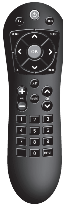
OCE-0189B REV 04 (03/19/21)